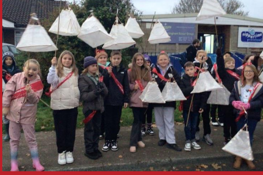
Taking part in the Village Lantern Parade